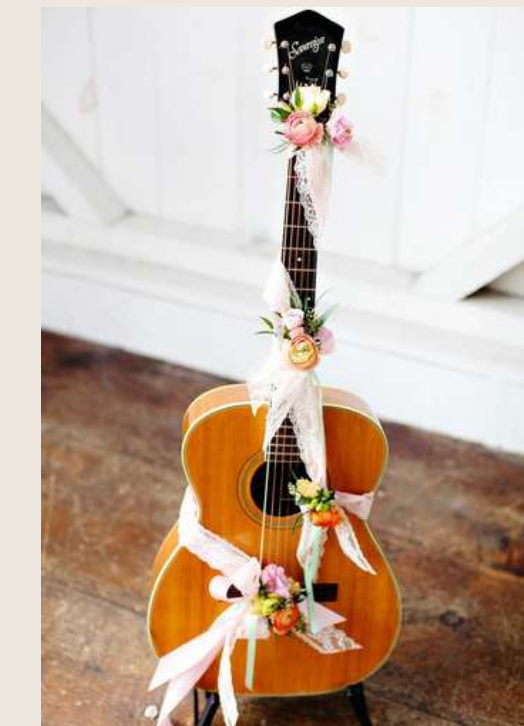
CREATE YOUR OWN BAND