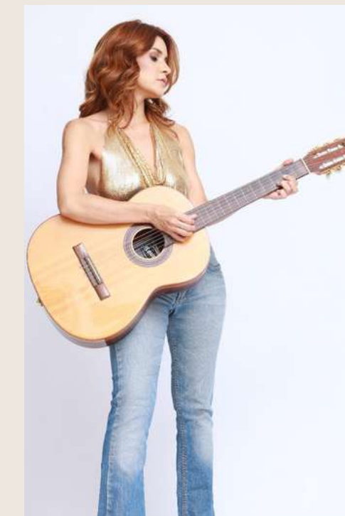
JAZZ AND BRAZILIAN VIBES