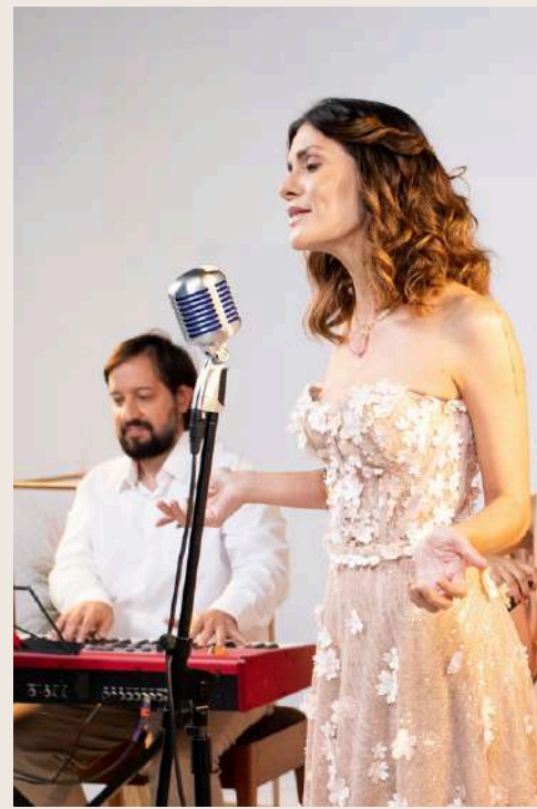
VOICE AND PIANO