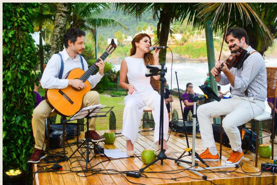
Musical trio at a beach wedding