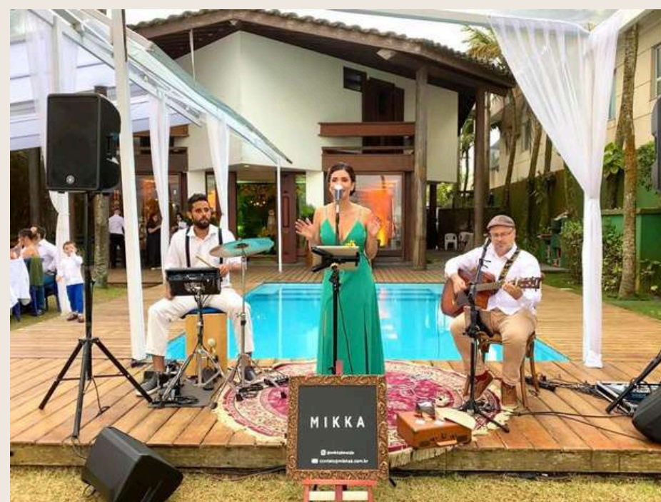
Musical trio at a beach wedding