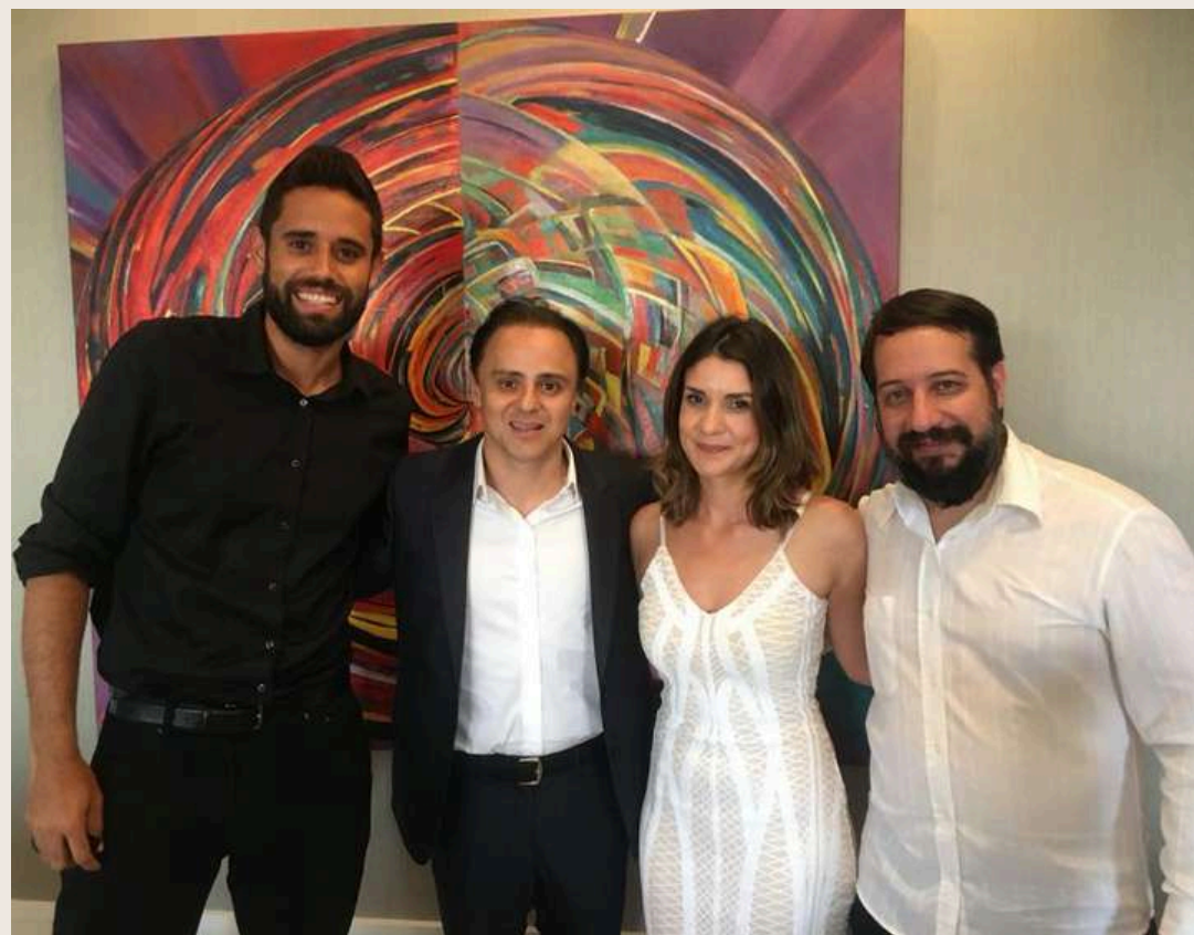
Cocktail of Brazilian F1 Driver Felipe Massa