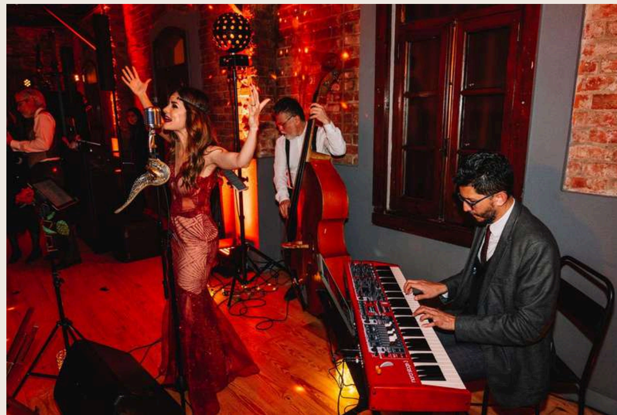
Themed Party – 1920s Jazz – Lisbon