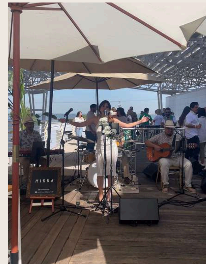
Samba Circle for Sporting Clube Lisboa event